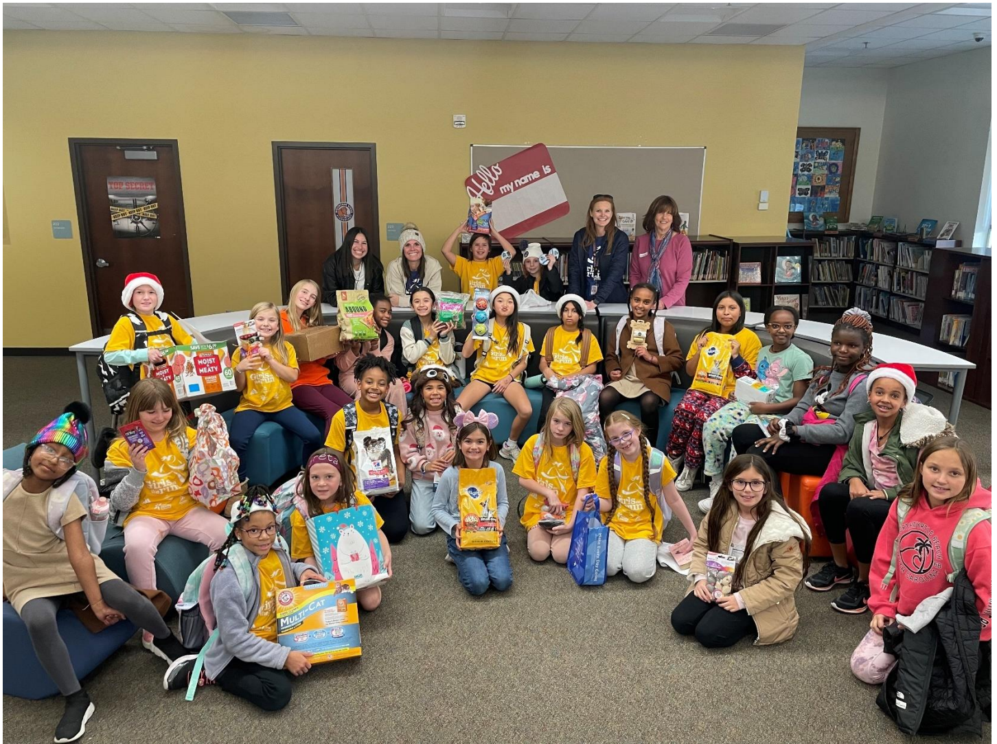
Mountain Vista's Girls on the Run Team